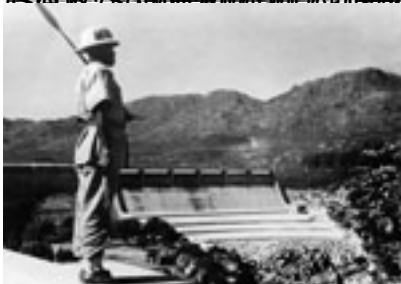
South Africa for a (South Africa) by Italian troops in Ethiopia