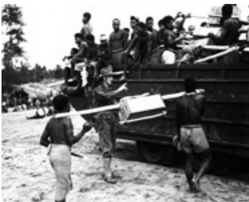
August 1944: Local porters for the Allies at the front-line in the mountains of New Guinea