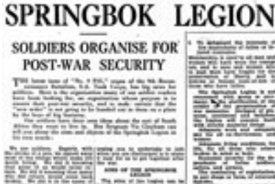
The Guardian, 10.11.1941 - Soldiers demand post-war security