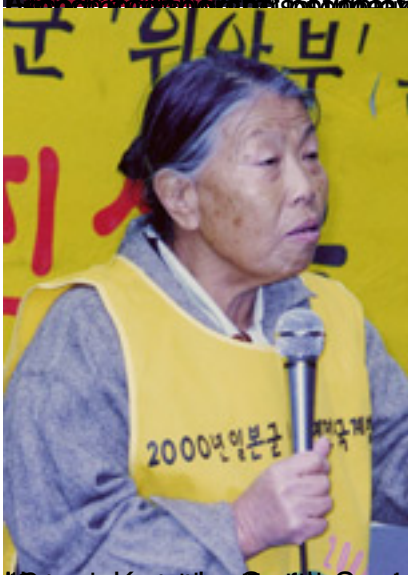
(Dancing station, South Korea) (bottom) abducted and abused by the Japanese Military at the age of