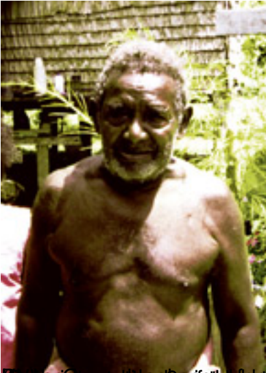
Resident of the President Islands, Kennedy, lives of John F. Kennedy.