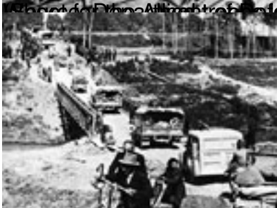
South Africa for a (South Africa) by Italian troops in Ethiopia