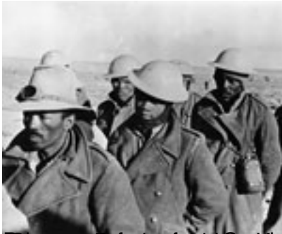
Disarmed soldiers from the Afrika Korps in the North African desert