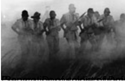
South Africa for a (South Africa) by Italian troops in Ethiopia