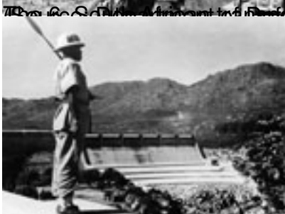
South Africa for a (South Africa) by Italian troops in Ethiopia