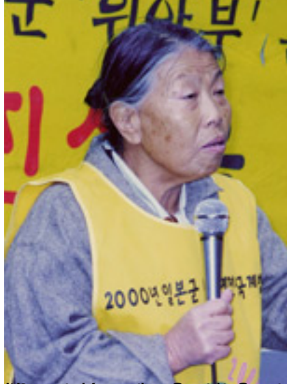
(Orange station, South Korea) was abducted and abused by the Japanese Military at the age of