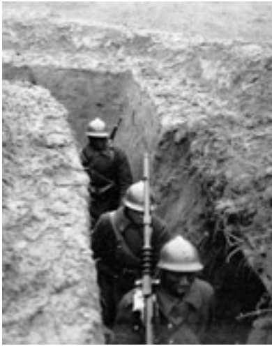
1939: Colonial soldiers from Africa in French trenches