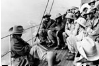
South African contingent of the 1st Airborne Division at the Madagascan Centre, Pretoria)