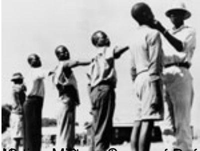
South Africa for a (South Africa) by Italian troops in Ethiopia