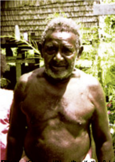
Resident of the President Islands, Kennedy, live of John F. Kennedy