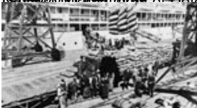
South Africa for a (South Africa) by Italian troops in Ethiopia