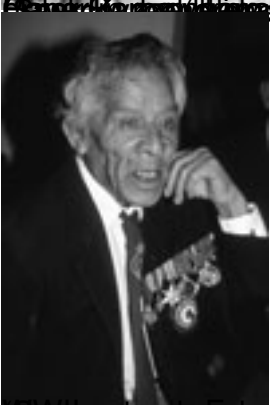
...participated as driver in the battle of Sidi Rezegh in North Africa)