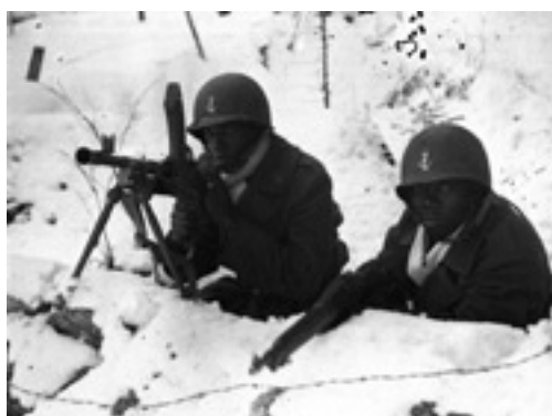
Colonial G.I.'s from Africa in winter 1944 in Northern France