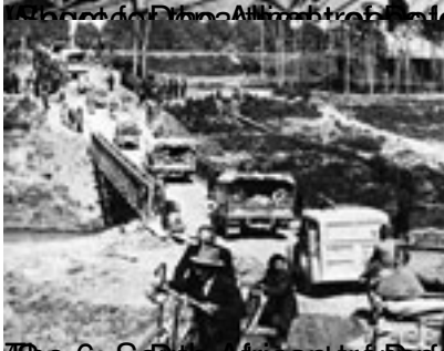
South Africa for a (South Africa) by Italian troops in Ethiopia