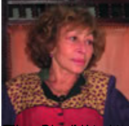
France 1957 (middle) rejection of the anti-Semitic laws enforced in Algeria by the