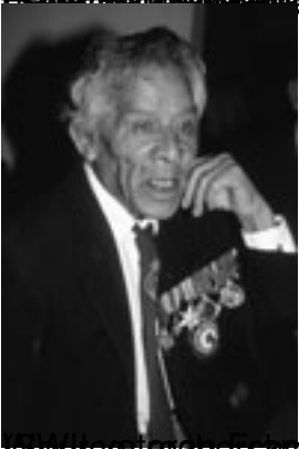
...participated as driver in the battle of Sidi Rezegh in North Africa)