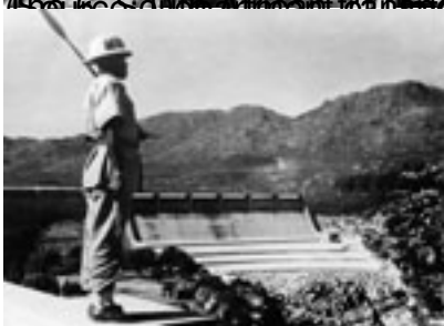
South Africa for a (South Africa) by Italian troops in Ethiopia