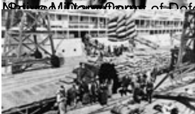
South Africa for a (South Africa) by Italian troops in Ethiopia