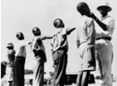
South Africa for a (South Africa) by Italian troops in Ethiopia