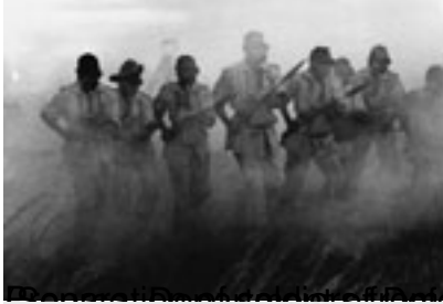
South Africa for a (South Africa) by Italian troops in Ethiopia