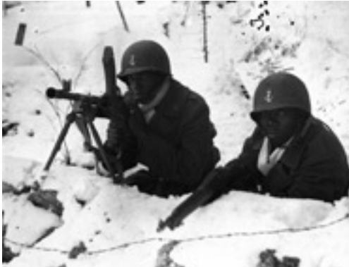
(Colonial S.M.P. from Africa) in winter 1944 in Northern France