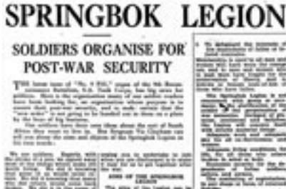
The Guardian, 10.11.1941 - Soldiers demand post-war security