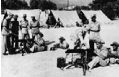
Reinforcement of the Cape Documentation Centre, Pretoria)