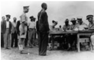
May 1940: Recruiting of Cape Corps volunteers