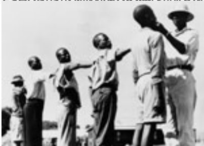
South Africa for a (Seite 88 unten)