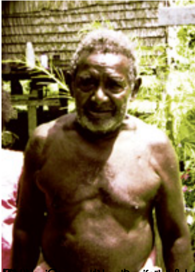
Resident of the President Islands on the President Islands, Kennedy live of John F.