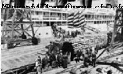
South Africa for a (Seite 88 unten)