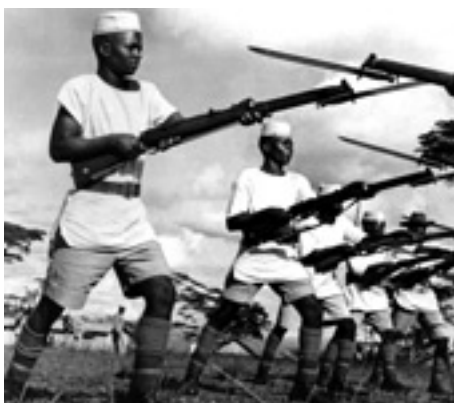
African soldiers of the British colonial Army