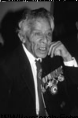
... participated as driver in the battle of Sidi Rezegh in North Africa)